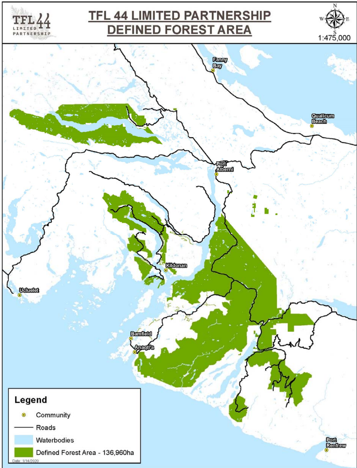
Figure 2 - Map of the Defined Forest Area