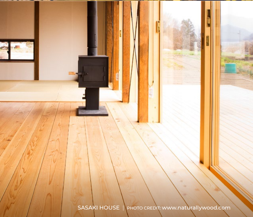
SASAKI HOUSE