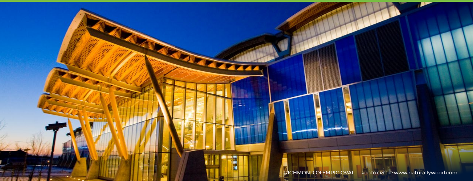
RICHMOND OLYMPIC OVAL

products focus and diverse product offering. Our large investment in manufacturing and progressive approach to safe and sustainable forestry practices ensures the health and prosperity of our business, forests and communities for generations to come.