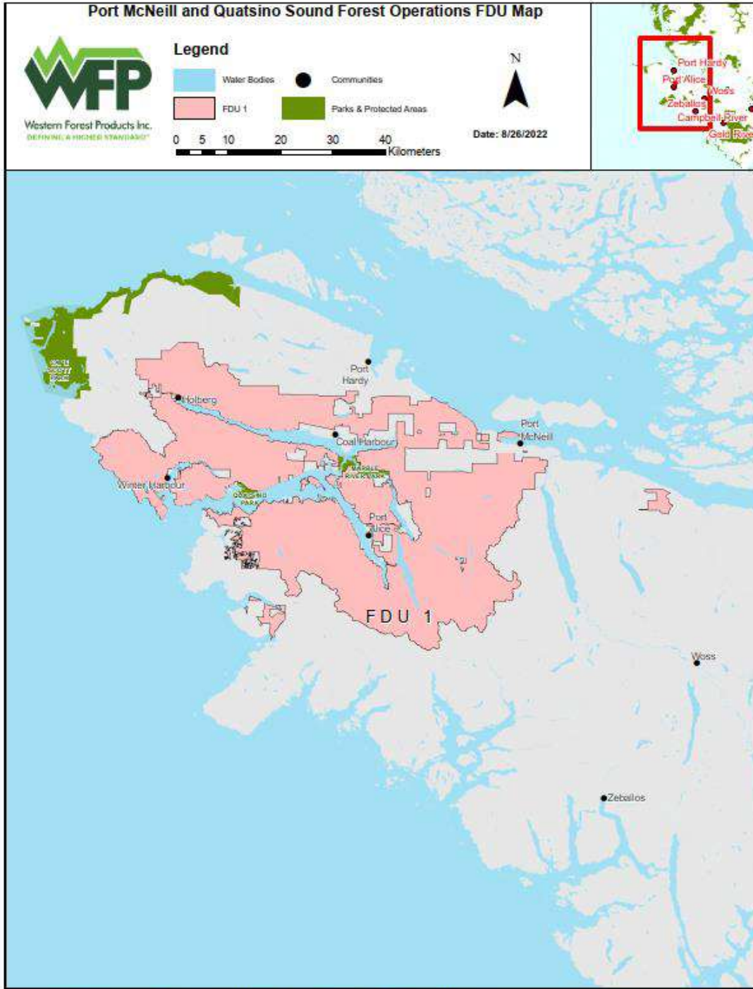
Figure 1 – FSP Forest Development Unit – Overview Map